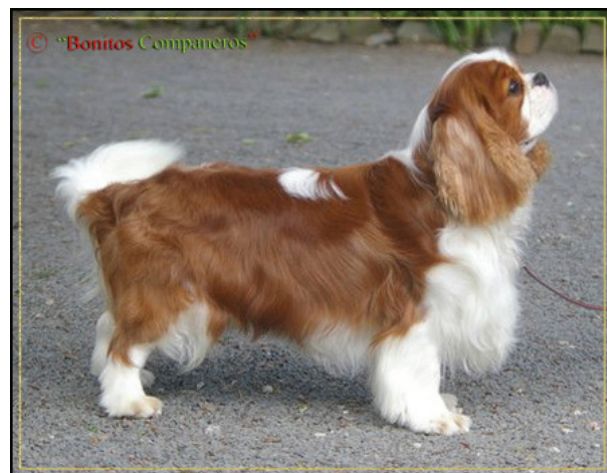
Bonitos Companeros Unbelievable (Blake) at 4 mos. & 17 mos. (UK Ch. Maibee Make Believe x Int'l, Ger. & Austrian Ch. Aranel Energie)